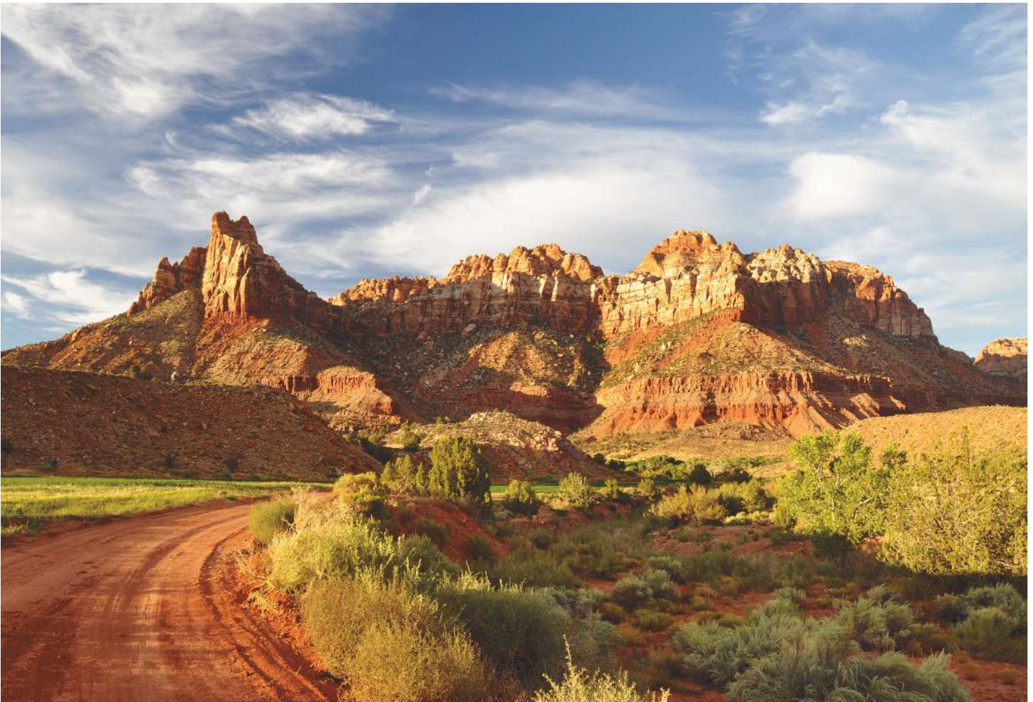
Above. Brilliantly colored Navajo sandstone is a hallmark of the Trees as well as Zion National Park.